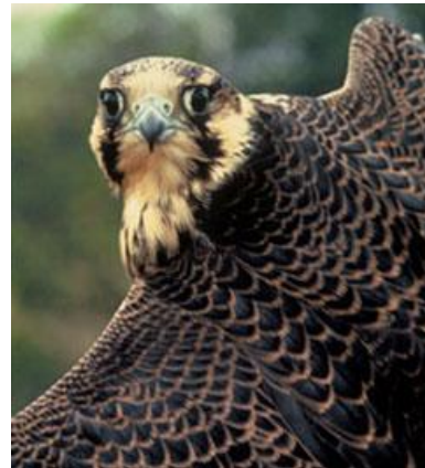
Peregrine Falcon U.S. Fish and Wildlife Service